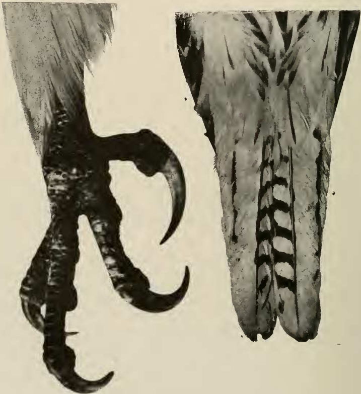
Falco islandus , White Gyrfalcon, female. (No. 608 collection of W. F. H., February, 1906, Kangek, near Goo!hab, Greenland.)

Three to six, laid in late May or June. 38 x 30 mm. Cream or clay-color, with many spots of reddish brown and blackish-brown, often entirely obscuring the ground color. Only one brood is raised.